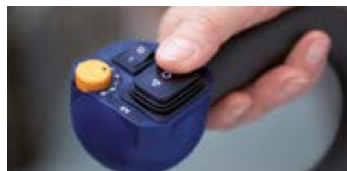
Control unit and handles were designed according to the latest ergonomic findings.

With the c-max aviation you can manage almost all types of stairs. Regardless of whether you are inside or outside, facing winding or straight stairs, the device climbs safely and comfortably.