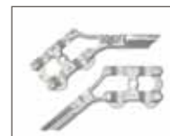
brackets for the wheelchair