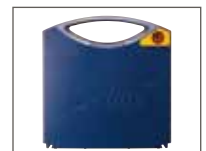
extra strong battery pack