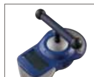
special fixture for quadriplegics