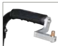
holding device for the attendant's control unit