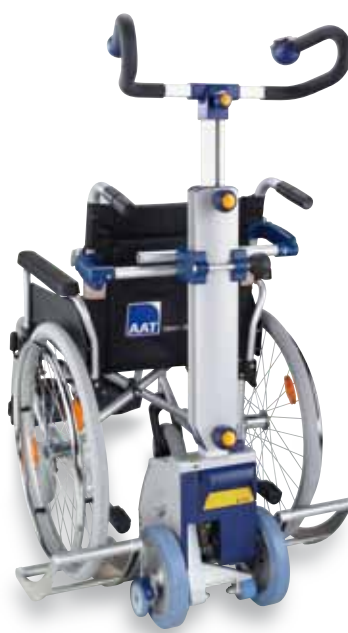
Universal rack SDM7

For a person who merely needs help climbing stairs the s-max sella is the optimum solution. The chair is particularly narrow and thus suitable for very narrow stairways and even winding stairs.