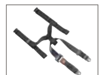
Seat belt system including hip belt**