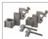
Brackets for the wheelchair