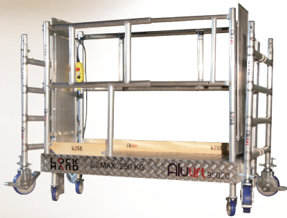
Article no. 100 S