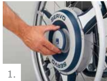
1. Unlock the wheel