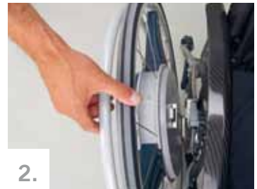
2. Remove the wheel

Innovative technology that inspires — mounting the SERVO