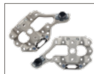
Brackets for the wheelchair