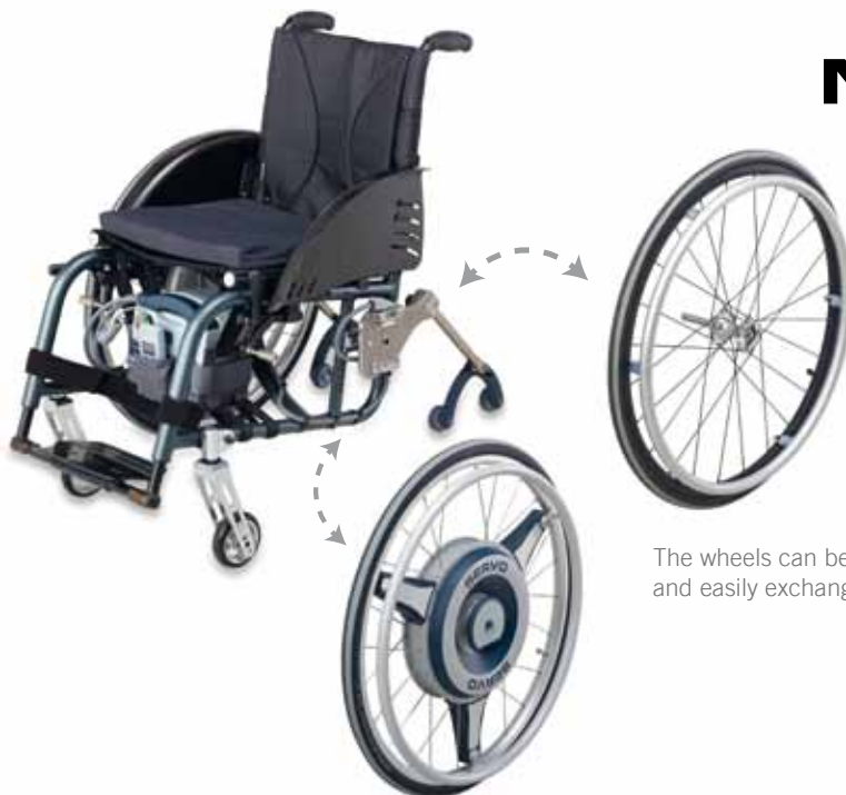
The wheels can be quickly and easily exchanged.

Innovative technology that inspires — mounting the SERVO