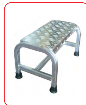
1 step Cargo stools