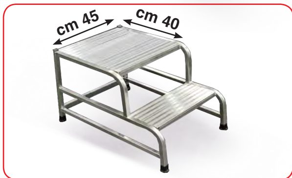
Cargo with 2 steps and deeper platform