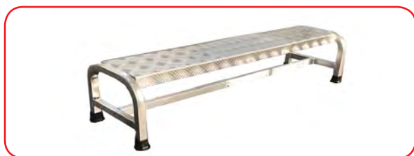
Cargo Special sizes