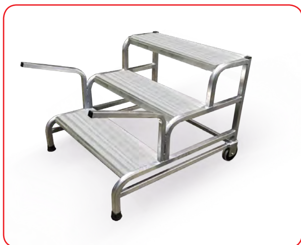
Cargo 3 steps with handel and wheels Kit