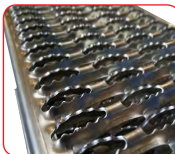
Optional special grid aluminium steps (supergrip for oil and snow)