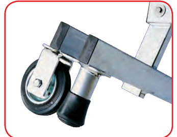
Wheels Ø mm 125