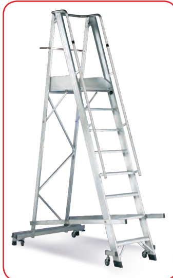
On demand: Castellana 4WD (with 4 spring selflocking wheels)

* Higher models have stabilizer also on the back ramp (120 cm) and an additional reinforcement bar (assembled by the customer).