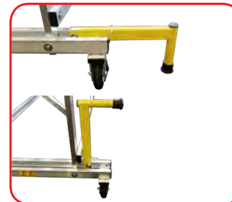
Optional: Closable stabilizer (overall dimensions closed 100 cm)