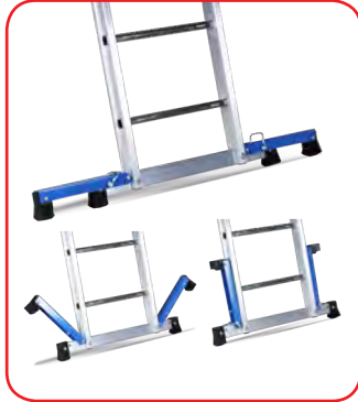
Optional: SALLAR31 Folded length mm 825 Open length mm 1300