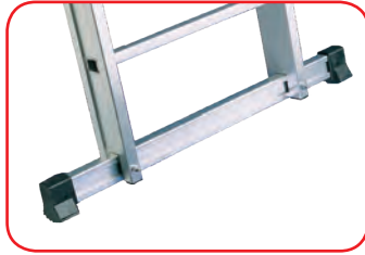
Base stabilizer E2/E3