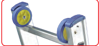
Non-slip rubber wheels just for E3-E3Fx12/14/16