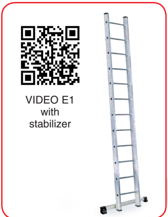
VIDEO E1 with stabilizer