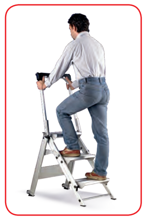
Tool-holder and bucket hook