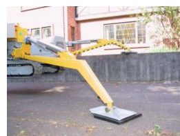
Easy set up