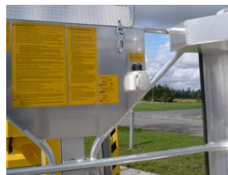
230 V outlet in basket