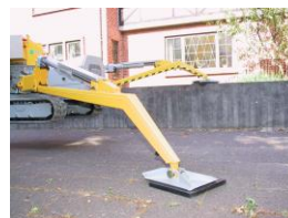
Easy set up