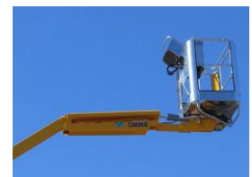
Fly jib (option)